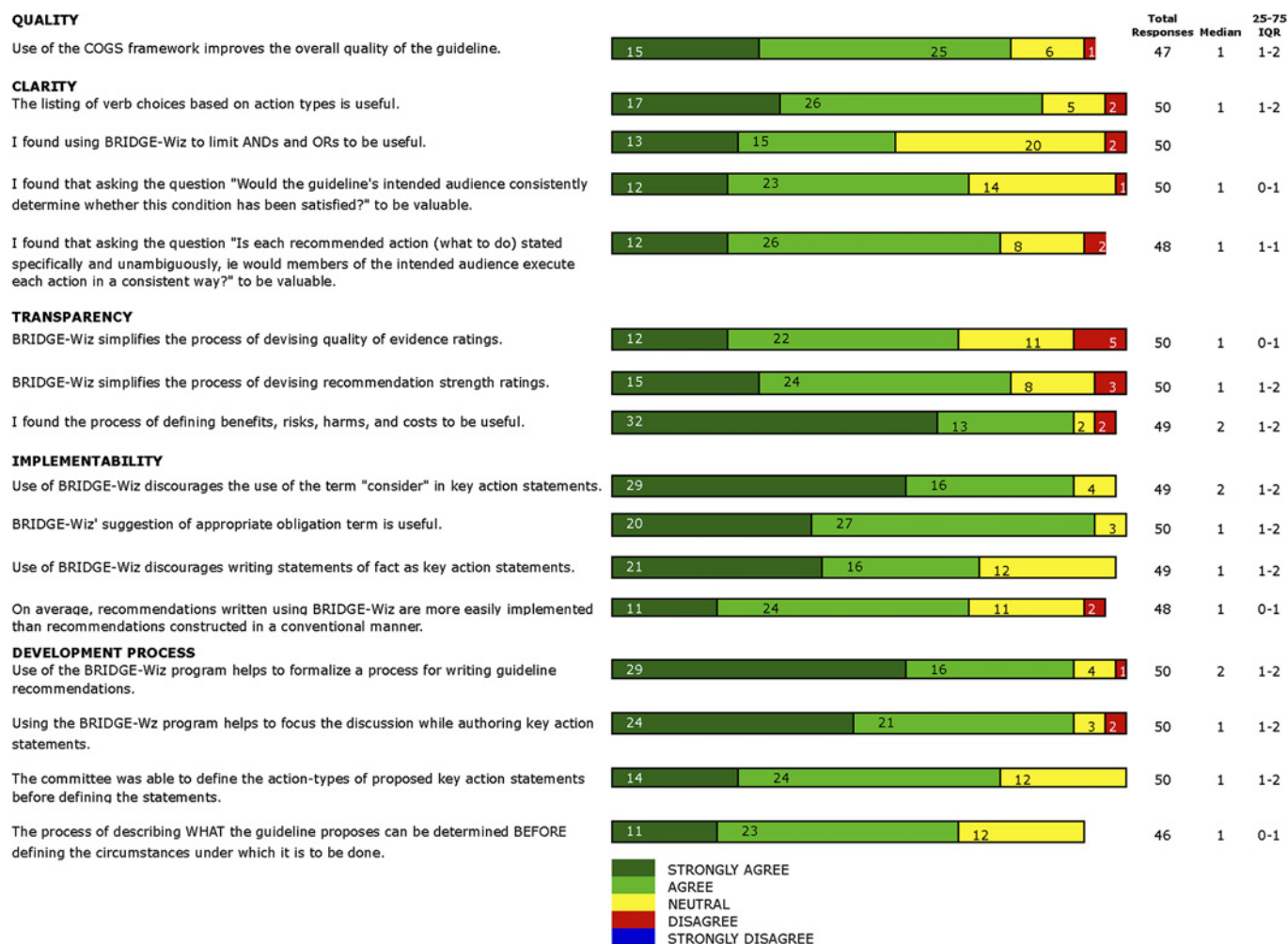
Figure 5 Panelists' responses to survey questions. Numbers on the bars represent the number of respondents choosing each level of agreement. The number of panelists responding to the item is displayed in the column entitled 'Total responses'. Median response and 25th and 75th quartiles for each item are displayed.

development efforts). Panelists were also asked to record the most negative and the most positive aspects of the program in free text. These responses were analyzed to identify recurring themes and patterns. The survey was piloted among the authors to ensure clarity and comprehensiveness. The Yale Human Investigation Committee provided a waiver. Panelists were free to opt out of the survey.